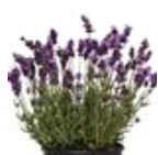
Avignon Early Blue